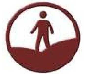
This sign says the land is access land

This map shows access land in pale blue, including the new access strip between Combe Field West and North . Combe Fields are County Wildlife sites, of note for their lowland chalk grassland. Hartslock is a Site of Special Scientific Interest – both for its lowland beech and yew woodland as well as the chalk grassland.