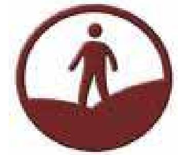
This sign says the land is access land

Welcome to this area of access land. This map shows access land in pale blue, and is derived from Natural England's Map of Access Land. This site is a County Wildlife Site, of particular importance for its lowland chalk downland and associated flora. There are no public rights of way or through routes