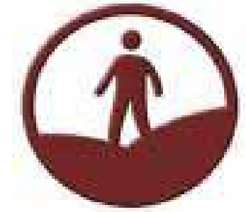
This sign says the land is access land

Welcome to this area of access land. This map shows access land in pale blue, and is derived from the Natural England Conclusive Map of Access Land. PLEASE DO NOT FEED ANIMALS OR DROP LITTER